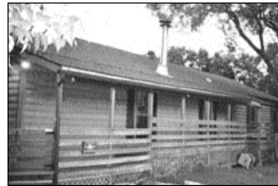
Prepared from documents provided by

Hopefully, your manufactured home purchase won't lead to these steps. However, knowing your options from the beginning can help guide you to a happy purchase.